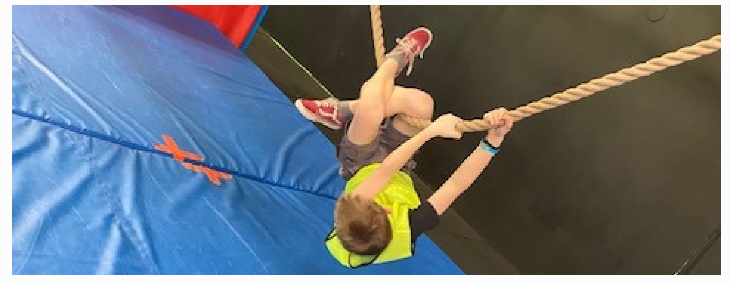
Hangin' out at Ninja West