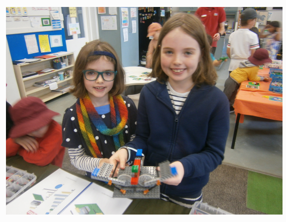
A Lego creation made during Bricks4Kids incursion

Although we have previously been able to use the pool during the summer months, this activity is currently under review by the SCC committee. This is due to a recent change in our licensing agreements with the childcare governing body. As soon as we have come to a decision, we will inform our families.